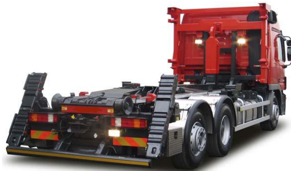
Pic. 5: ContiLift Hook Lift SC 266 with Adapter Kit ICAK-20-H for 20' ISO Container