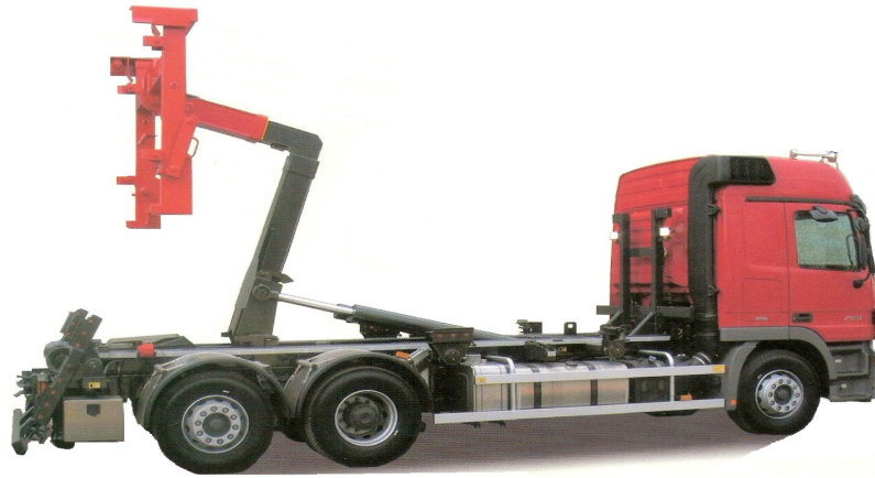
Pic. 1: ContiLift Hook Lift SC 266 with Adapter Kit ICAK-20-H for 20' ISO Container