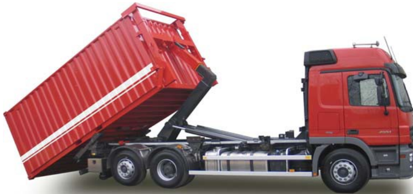
Pic. 2: ContiLift Hook Lift SC 266 with Adapter Kit ICAK-20-H for 20' ISO Container