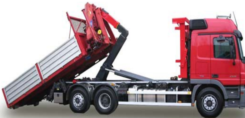
Pic. 3: ContiLift Hook Lift SC 266 with Adapter Kit ICAK-20-H, Platform & Crane

No. 89, 6F, Chingdong St., 70144 Tainan/Taiwan ROC * Website: www.eos-enviro.com