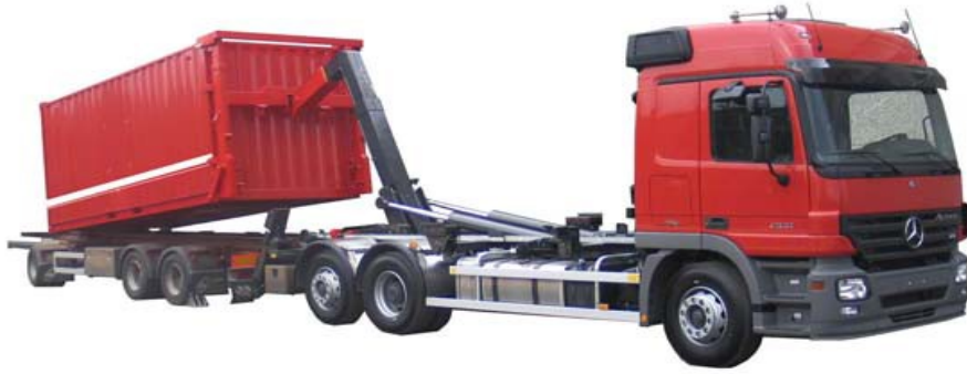
Pic. 4: ContiLift Hook Lift SC 266 with Adapter Kit ICAK-20-H/20' ISO Container on Trailer